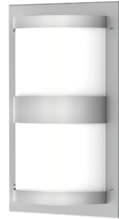
NT finish, VB0 trim