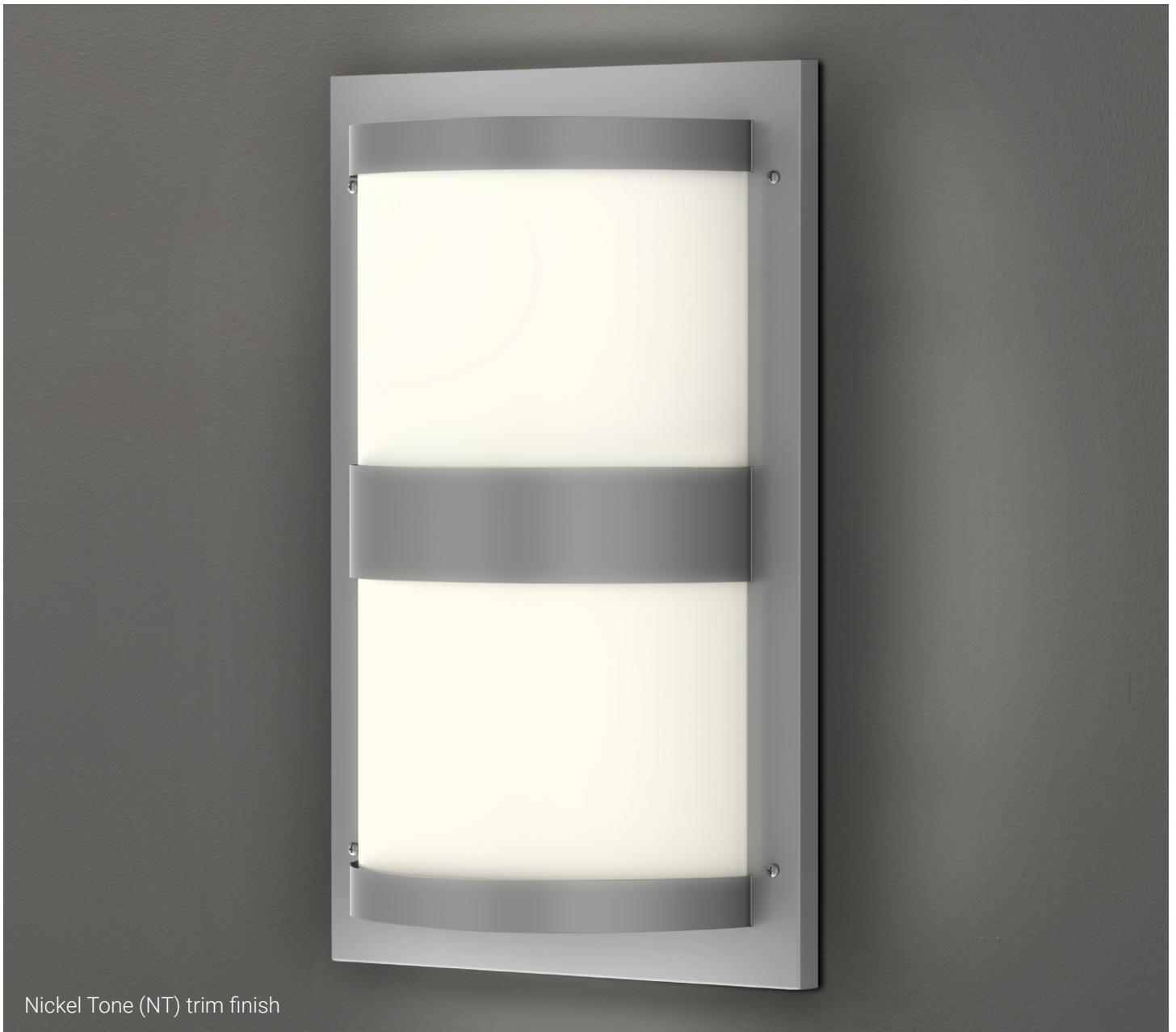
Nickel Tone (NT) trim finish