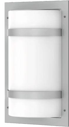
NT finish, VB0 trim