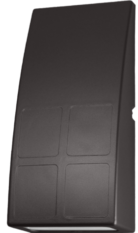
BZ finish, WHA diffuser