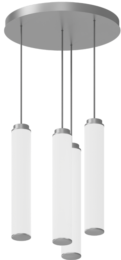
24" - 4 Cylinder Cluster