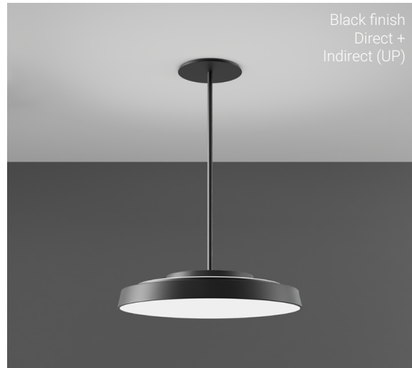
Black finish Direct + Indirect (UP)