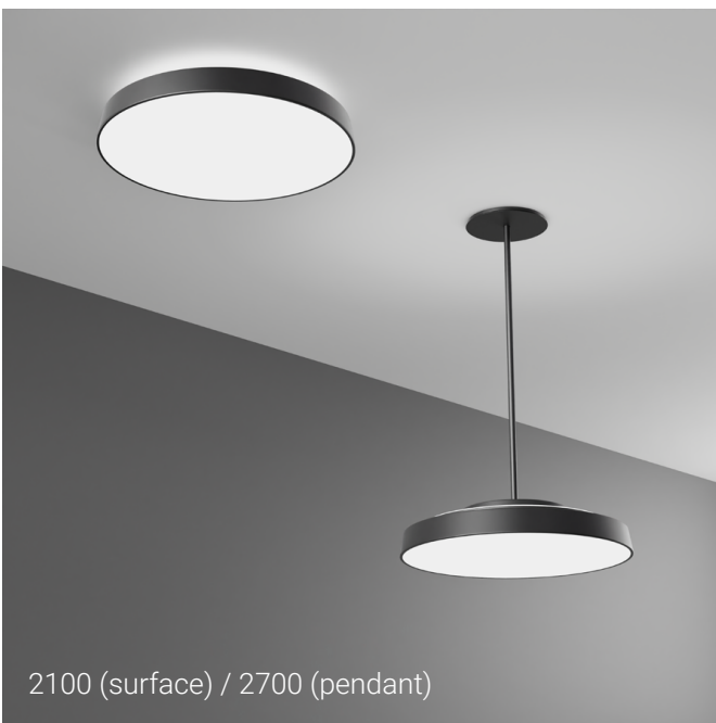
2100 (surface) / 2700 (pendant)