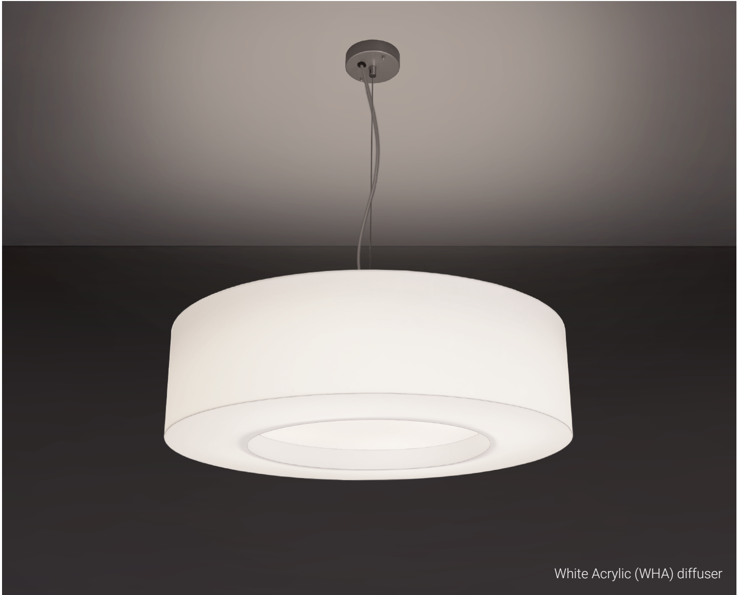
White Acrylic (WHA) diffuser