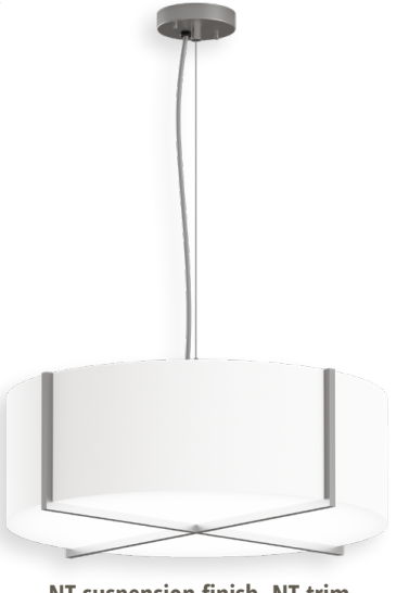
NT suspension finish, NT trim finish, CC1 suspension