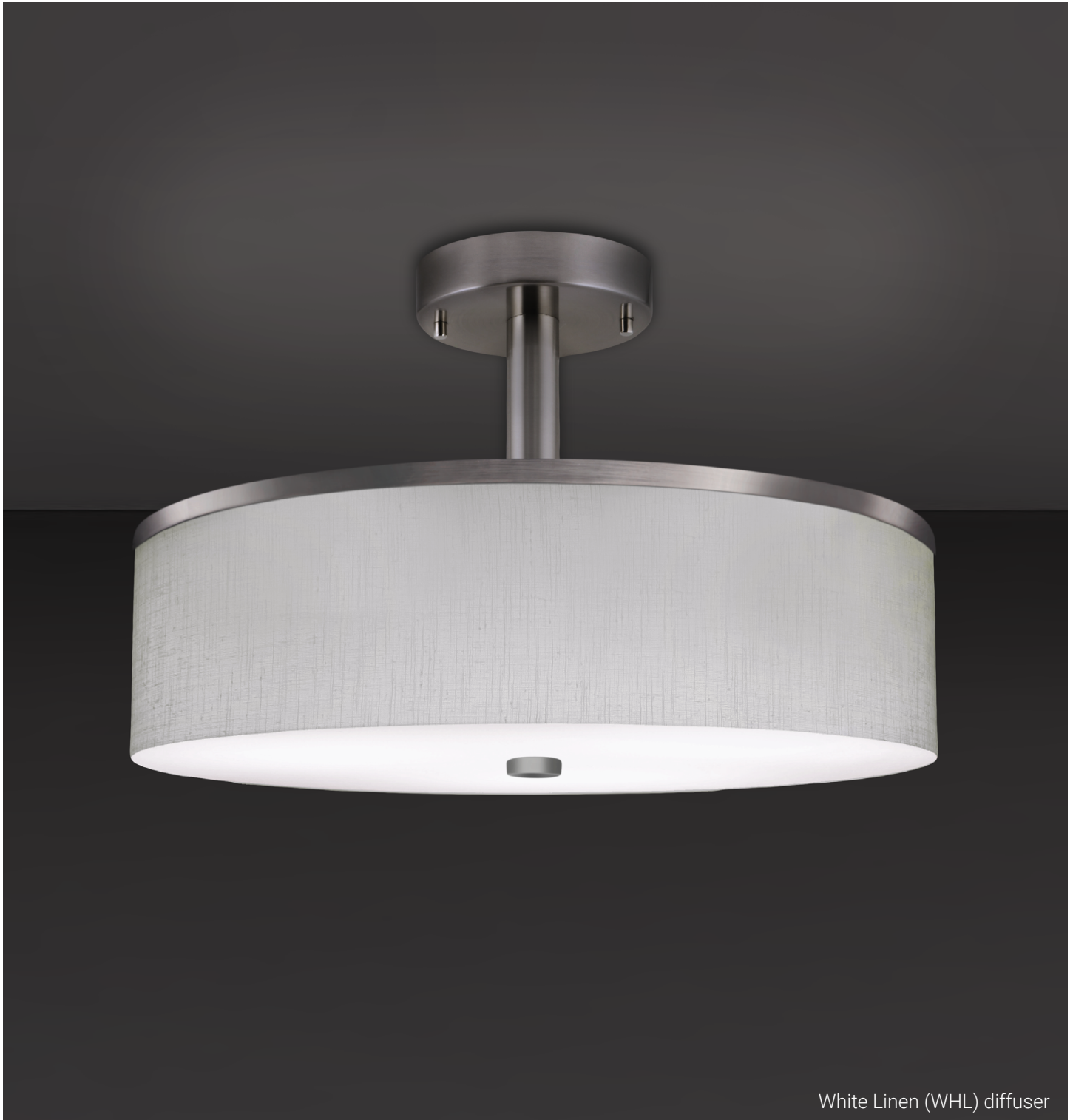
White Linen (WHL) diffuser