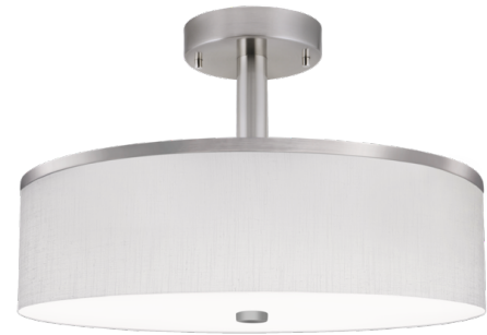
BN finish, WHL diffuser