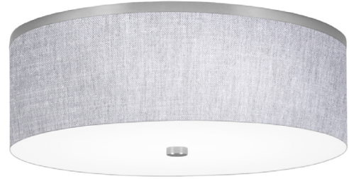
BN finish, GYL diffuser