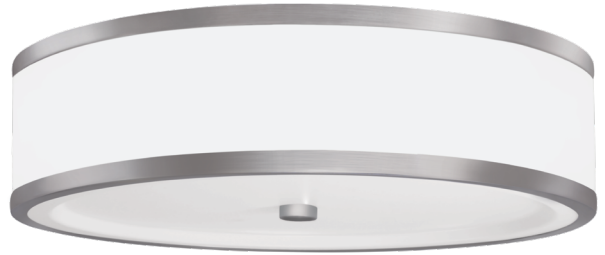
BN finish, WHA diffuser