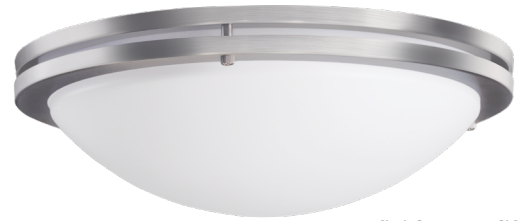
BN finish, WHA diffuser