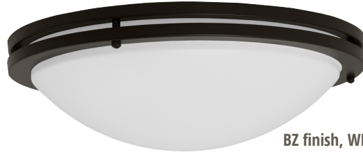
BZ finish, WHA diffuser